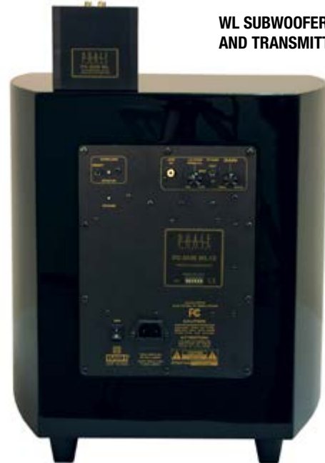
WL SUBWOOFER REARVIEW AND TRANSMITTER

Thank you for choosing Phase Technology ® speakers. We know there are a wide variety of choices available today, and we sincerely appreciate your purchase of our product. Phase Technology speakers are built to exacting standards and will provide many years of listening enjoyment.